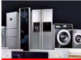
Home Appliance More+