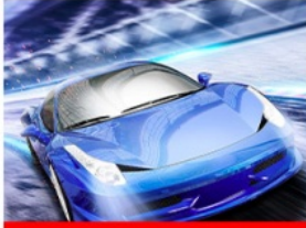
Car Industry More+