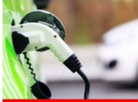
New Energy More+