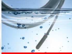
TPE Temperature Sensor More+