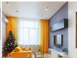
Home Industry More+