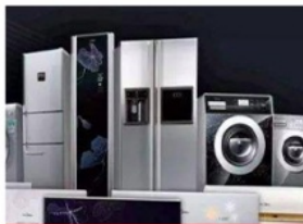
Home Appliance More+