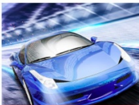
Car Industry More+