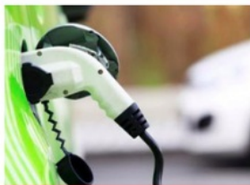
New Energy More+