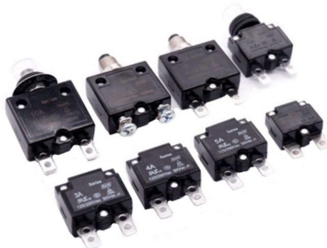
Current overload protector/circuit breaker

Overload Protector is the perfect choice for protecting your electrical appliances from overload and short circuit. This product features a hard silver case and plastic use, with a maximum current of 10A. It is designed with a black+red color and weighs only 0.0025kg. Moreover, it also has thermal protector and small current protector, making it ideal for protecting your electrical appliances from overload and short circuit. Its 16A red piston makes it highly durable and reliable. Get this Overload Protector for maximum safety and security of your electrical appliances.