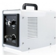
UPS uninterruptible power supply