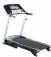
Automatic fitness equipment