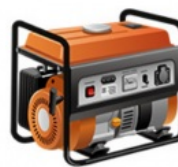
Small generators and various electric tools