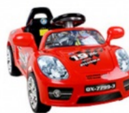
Children's toy electric vehicle